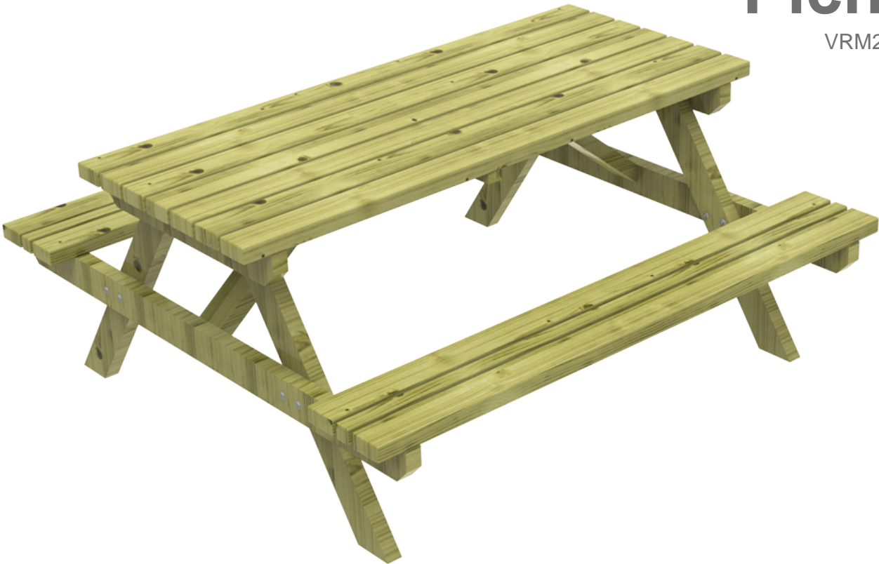
Table made of pine wood treated in vacuum pressure autoclave Class IV against woodworm, termites and insects. 1750 x 95 x 45mm boards.